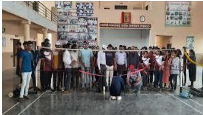
Indoor Sports Facility