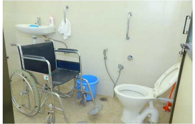
Facilities for Disabled