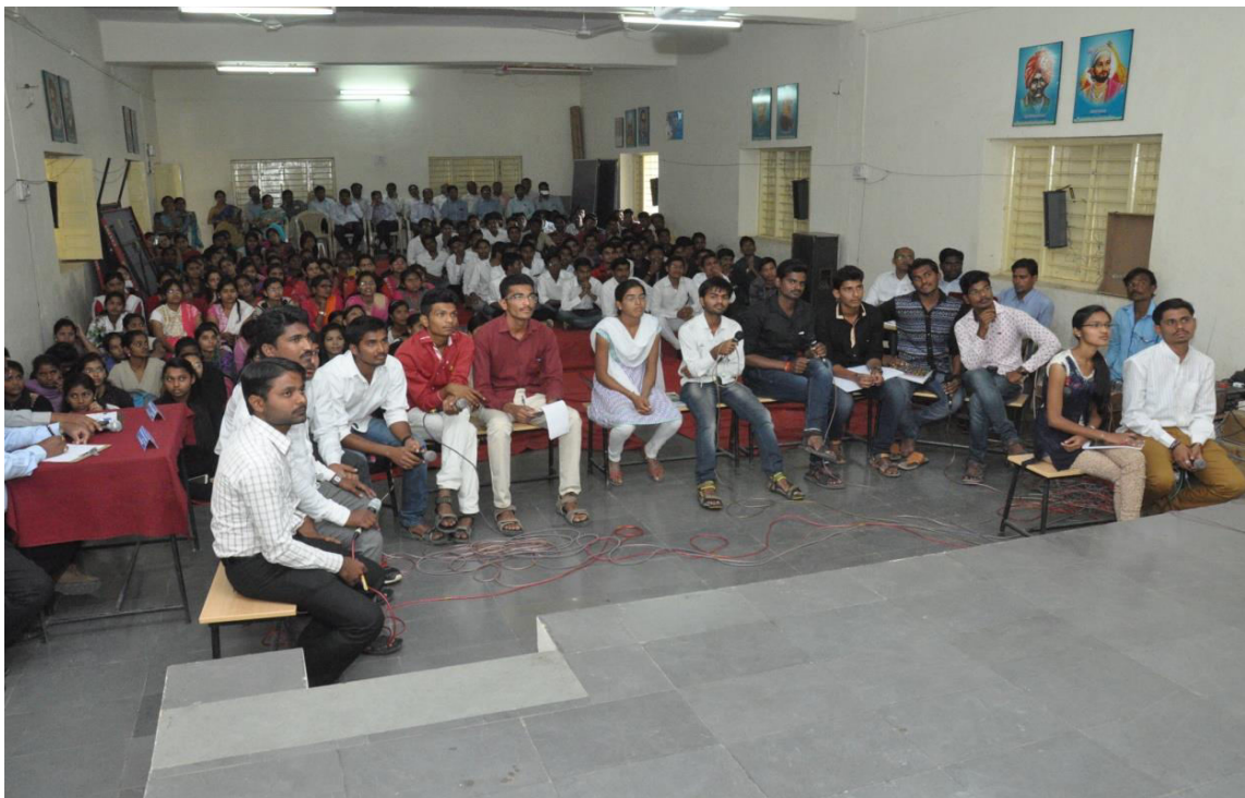
Audience during Quiz Competition 2018 at MCP Nilanga

within 1 min if the answer was wrong then one point of the team was deducted and these questions do not get passed on to the next team or to the audience.